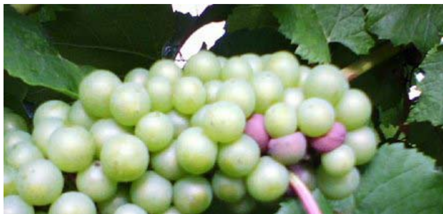
Pre-veraison botrytis infection in Chardonnay in the Finger Lakes.