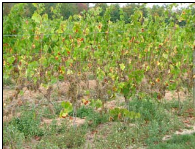
Drought-stress has affected parts of the Finger Lakes, including this block of Riesling.

Causes. Exact causes and chemistry behind ATA are not well understood. But the symptoms are particularly correlated to droughty years, and